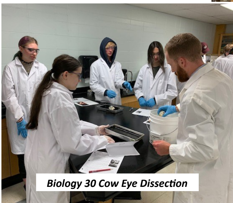
Biology 30 Cow Eye Dissection