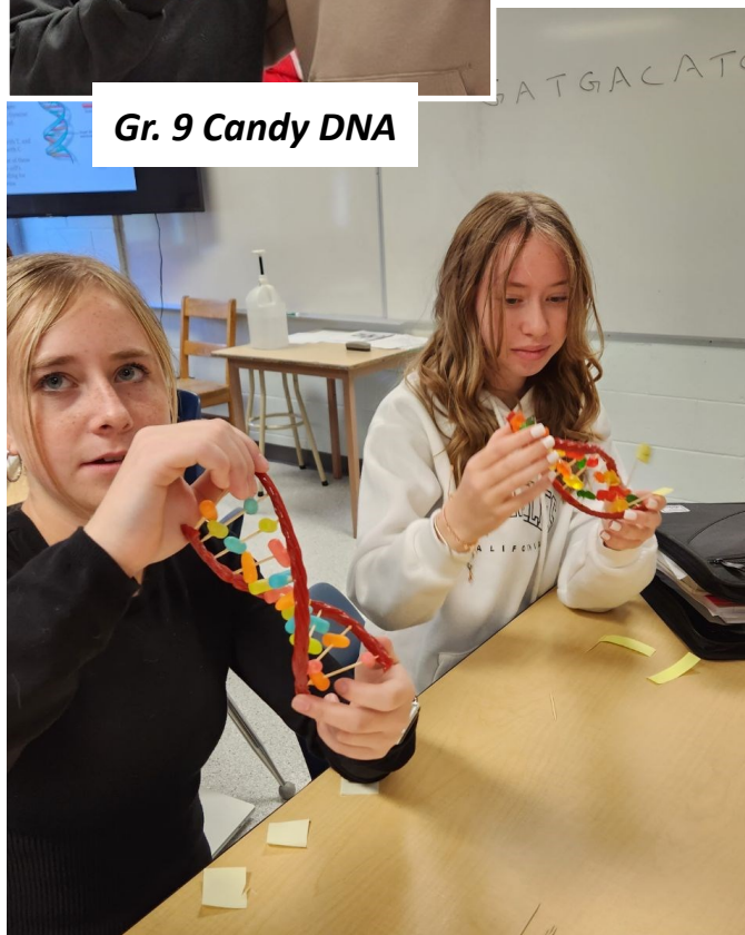
Gr. 9 Candy DNA