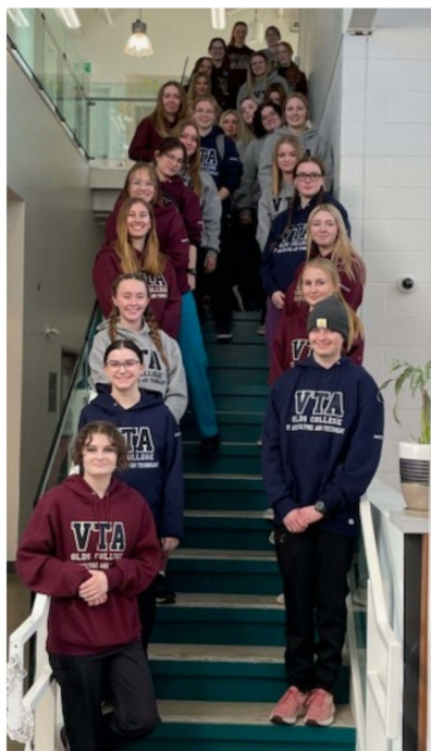
Veterinary Tech - dual credit students

The goal of dual credit is to provide students with skills and experience necessary to transition successfully to post-secondary learning for their career of choice learning. We want students to leave high school engaging in the career pathway that they are passionate about. About 490 Chinook's Edge students enrolled in dual credit this year.