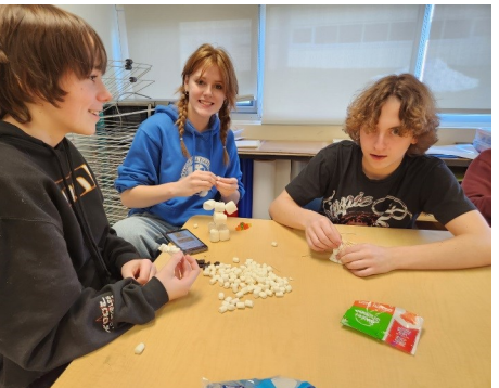
Art 9 finished with some fun, and tasty, marshmallow sculptures!